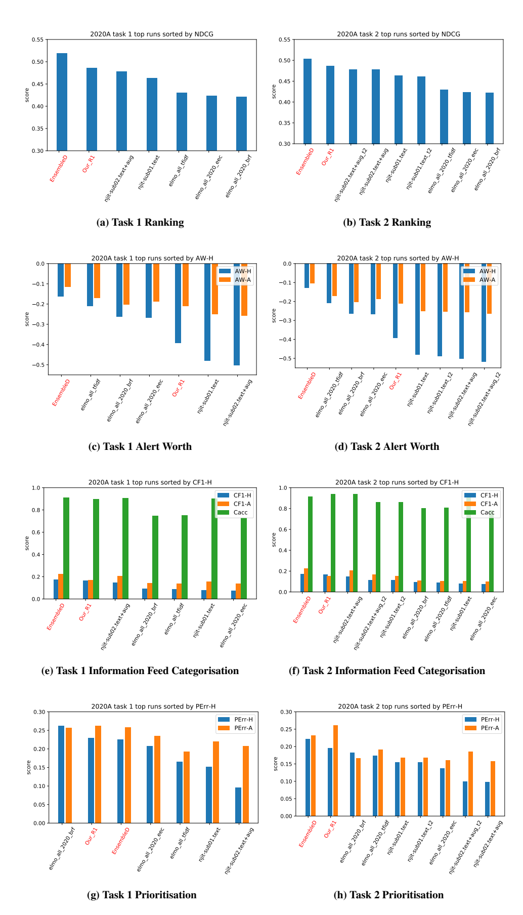
Figure 3. Performance comparison between TREC-IS 2020A top participating runs for both task 1 and 2, which are evaluated from four major aspects: Ranking, Alert Worth, Information Feed Categorisation and Prioritisation. Our runs are annotated in red and the rest are other participating runs.